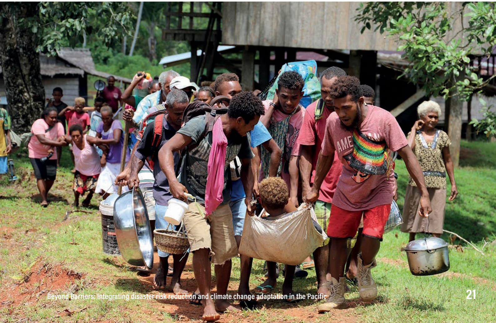
Solomon Islands evacuation simulation (Oxfam)

improving practices and avoiding negative impacts (Hay and Mimura 2013; Griffin NRM 2016). The development of accessible community-focused guidance and tools will encourage stronger engagement and help data and impact to be communicated in a way that is understood and owned by communities (Mercer et al. 2014; Moser and Ekstrom 2010; Natoli 2019). The importance of regular monitoring and reporting is emphasised in the FRDP; finding ways to ensure this process is streamlined and accessible to a wide range of stakeholders will be key to improving the accountability and effectiveness of integrated programming (SPC et al. 2020). There is also a significant opportunity to harmonize data collection and reporting efforts to ensure consistency and availability of data across the fields (Hay and Mimura 2013; Natoli 2019).