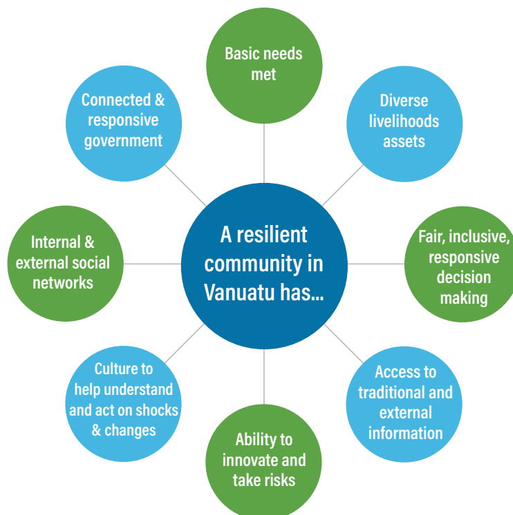
Figure 3: Vanuatu Community Resilience Framework

Figure 3 depicts the Vanuatu Community Resilience Framework.