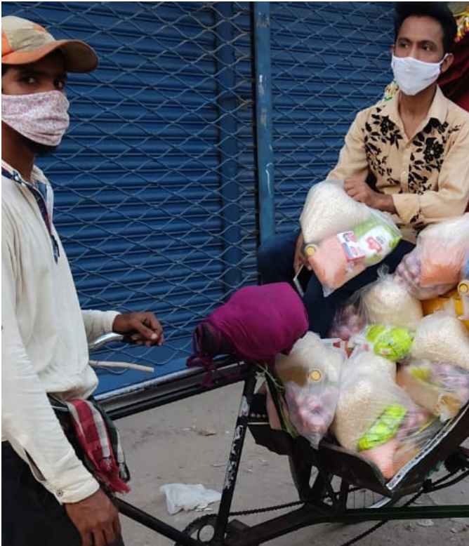
Volunteers from Somporker Noya Setu preparing to distribute care packages for hijra and transgender people in Dhaka, Bangladesh.

I lost my chickens and ducks because I was not able to buy food for them. Now, if I get some money to buy more than I can start again and earn on my own. Then I won't have to do my regular Hijragiri work. - community participant