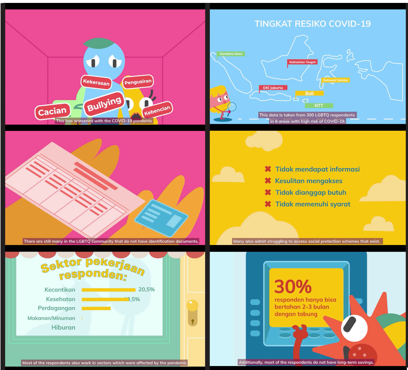
A selection of still frames from a CRM video on the impact of COVID-19 (CRM 2020).

The stories from Indonesia did not include extreme poverty, which one activist attributed to communal ways of life. Birth family remain an important source of financial support, even when it may be only part of a family that is supportive. There are also strong community networks amongst people with diverse