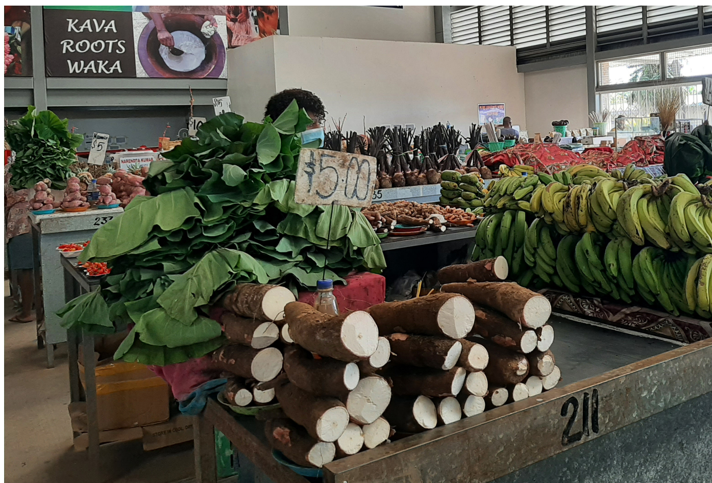
A market in Fiji.

It has also had the impact of reducing stress from not knowing where food or other necessities could be found, and has contributed to increased confidence about recovery. One recipient of cash through the Save