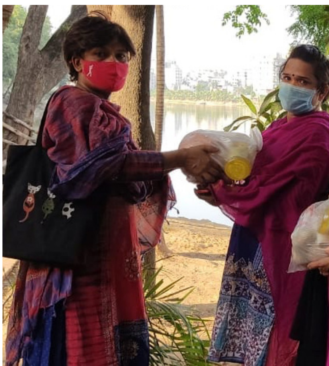
Hijra and transgender people receive aid packages from Somporker Noya Setu, in Dhaka, Bangladesh.

Not all people with diverse SOGIESC experience poverty, nor do people with different diversity of SOGIESC experience poverty in the same ways. In many parts of Asia and the Pacific there is more social, economic and legal space for diversity of gender identity, than diversity of sexuality. Other social norms intersect with diverse SOGIESC lives, and add further complexity relevant to social protection. For example, women with diverse SOGIESC may experience the impact of conventional gender norms as well as the norms pertaining to diversity of SOGIESC. People with diverse SOGIESC who are also part of religious or linguistic or ethnic minorities, or are people with disabilities or who live in rural areas or grow up in less affluent areas may all experience discrimination in marginalization in different ways, and experience different levels of socioeconomic exclusion.