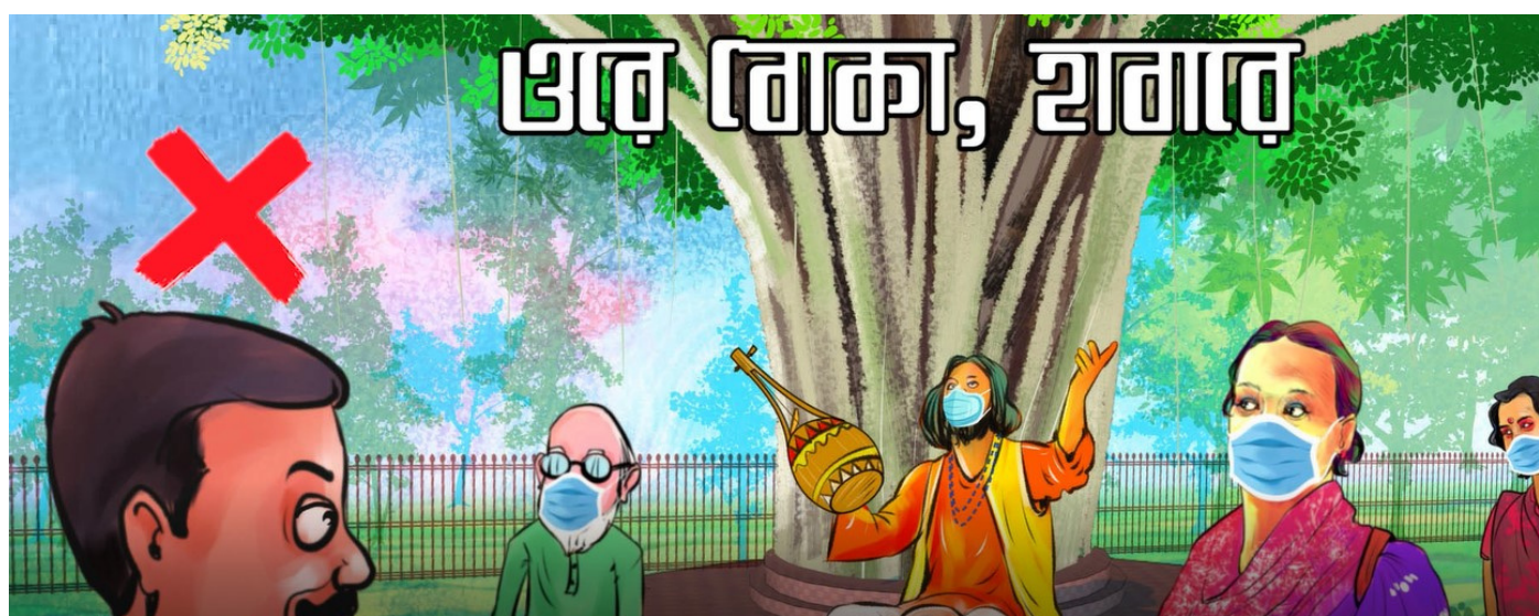
A panel from a Bandhu public communication campaign.

CSOs including Bandhu and Somporker Noya Setu have provided much of the aid reaching hijra and other diverse SOGIESC communities.