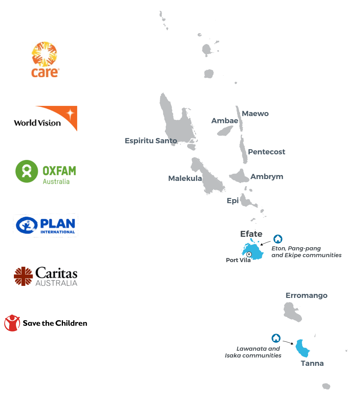
Figure C: Communities visited that receive assistance through Disaster READY

Disaster Ready Vanuatu is implemented by a consortium of six lead Australian NGOs and more than 15 local partners delivering risk reduction, adaptation and emergency response programming across the country. At the community level, Disaster READY focuses on community-based DRR and CCA, prioritising a balanced gender representation and including people with disabilities and a stronger youth voice. This includes building the capacity of Provincial Disaster and Climate Change Committees and CDCCCs to respond to local disaster events, supporting provincial emergency operations centres, advancing gender, disability and social inclusion leadership and capacity within national clusters and the NDMO, and building humanitarian capability within provincial and national government education and training departments.<sup>34</sup>