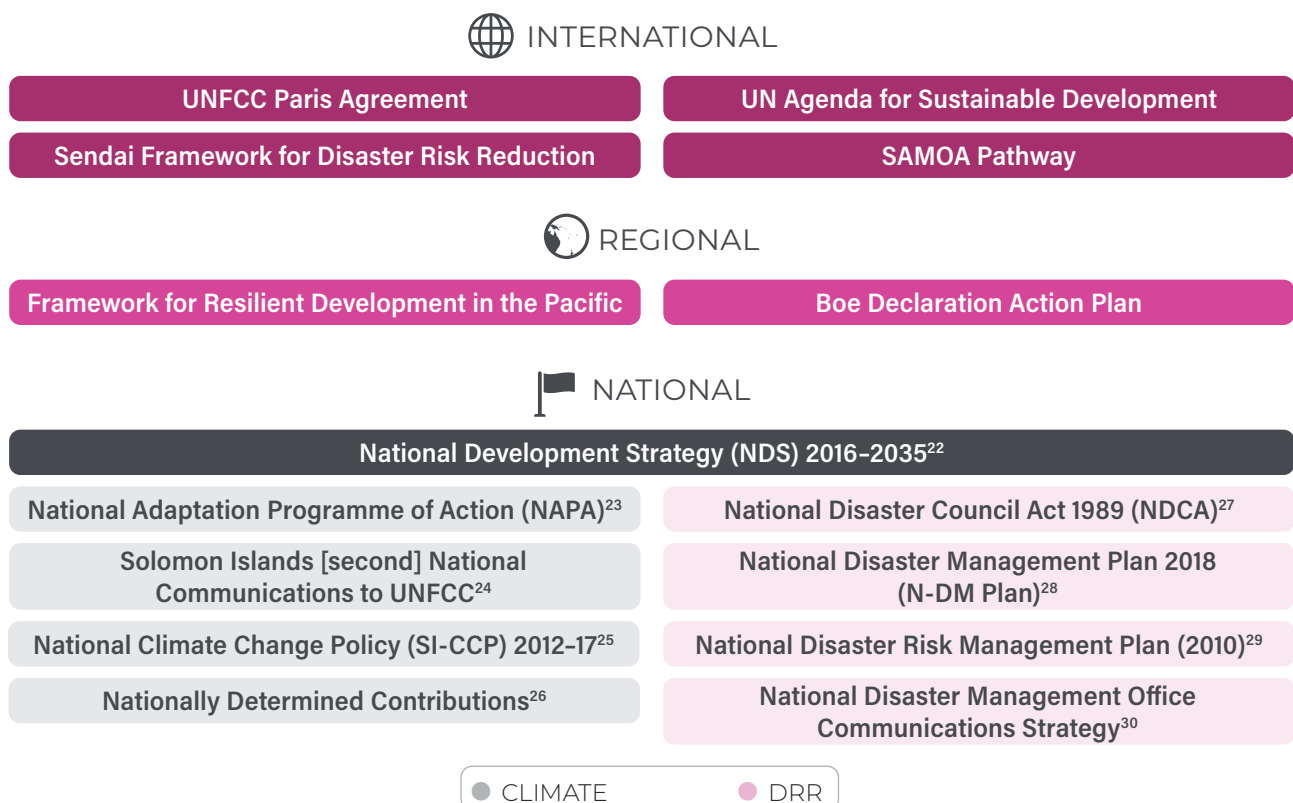
Figure B: Key plans, policies and frameworks for DRR and CCA in Solomon Islands

This section provides a high-level snapshot of the key policies, plans and frameworks for DRR and CCA in Solomon Islands, including relevant policies at the regional and international level that influence national policy instruments.