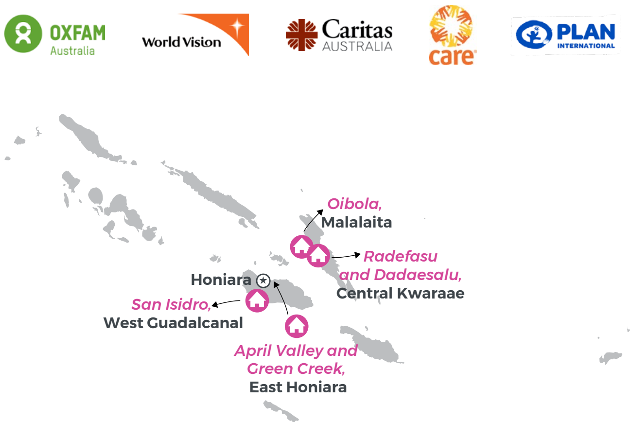
Figure D: Communities visited that receive assistance through Disaster READY

Disaster READY in Solomon Islands is implemented by a consortium of five lead Australian NGOs and more than 18 local partners delivering risk reduction, adaptation and emergency response programming across the country. At the community level, Disaster READY focuses on inclusive community-based DRR to ensure that people with disabilities, women, children and other vulnerable groups are involved in disaster planning, and their concerns are being considered. Activities include strengthening preparedness and response leadership in village-based institutions and schools, implementing village and school disaster action plans, and further connecting provincial disaster management offices and communities. 38