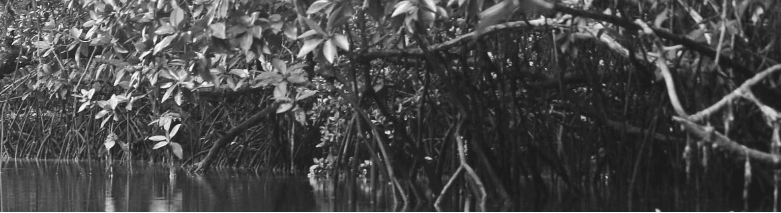
Figure A: Disaster and Climate Governance in Solomon Islands